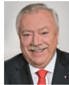
Michael Häupl Mayor and Governor of Vienna