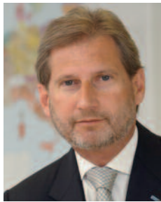
Johannes Hahn Member of the European Commission

The 3 RD ANNUAL FORUM OF THE EUSDR is a big opportunity to meet, discuss and decide the future of the Danube Region. It is about perspectives for our citizens. We look forward to meeting you in Vienna.