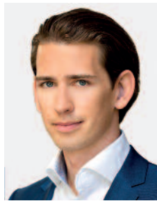
Sebastian Kurz Federal Minister for Europe, Integration and Foreign Affairs, Austria